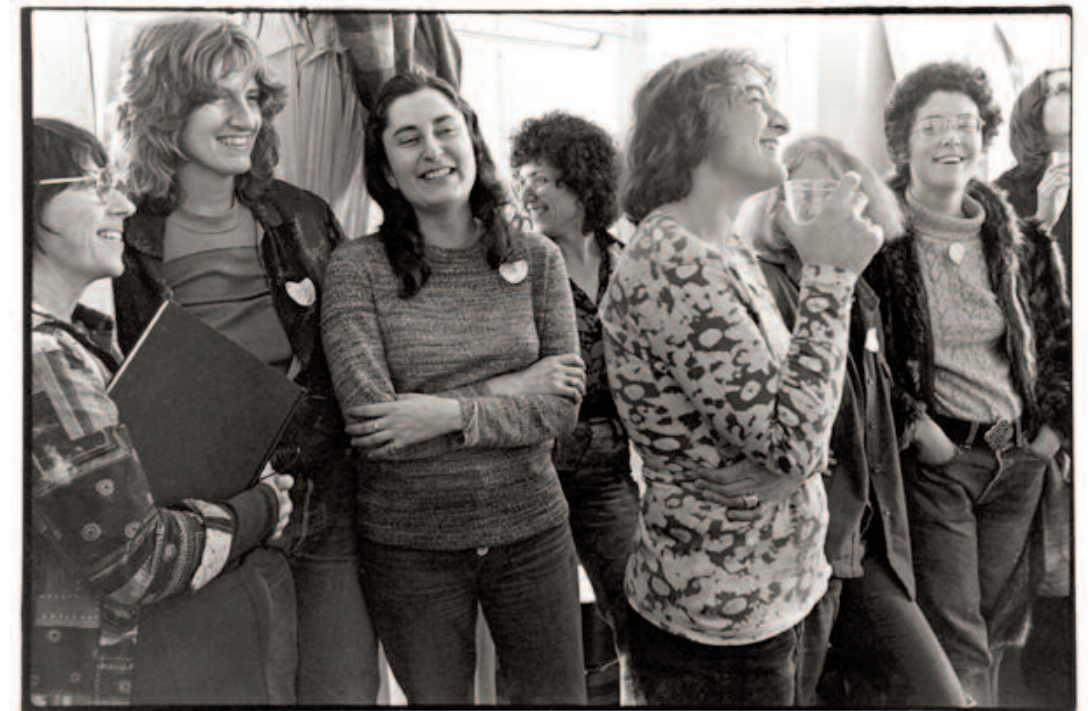
Lucy Lippard visits the Feminist Studio Workshop (Judy Chicago in background), 1974.