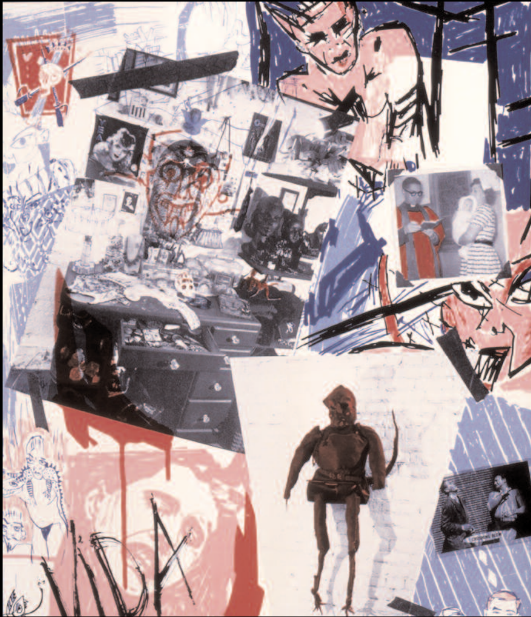
Diane Gamboa, Vida , 1986. From the "Cross Pollination" poster project. © Diane Gamboa.