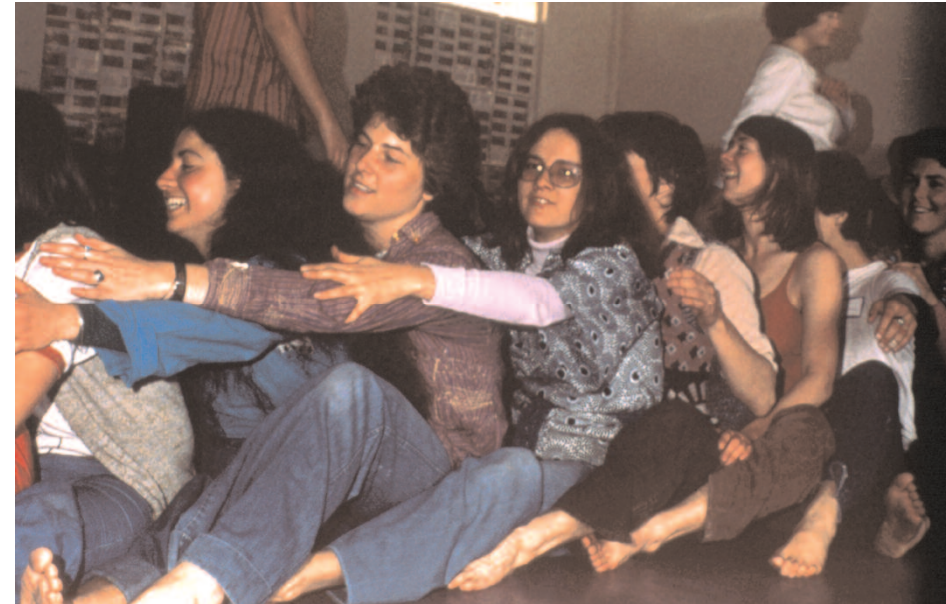
Workshop in Motion and Improvisation at the Performance Conference , March 25-28, 1978, at the Woman's Building, Woman's Building Image Archive, Otis College of Art and Design.