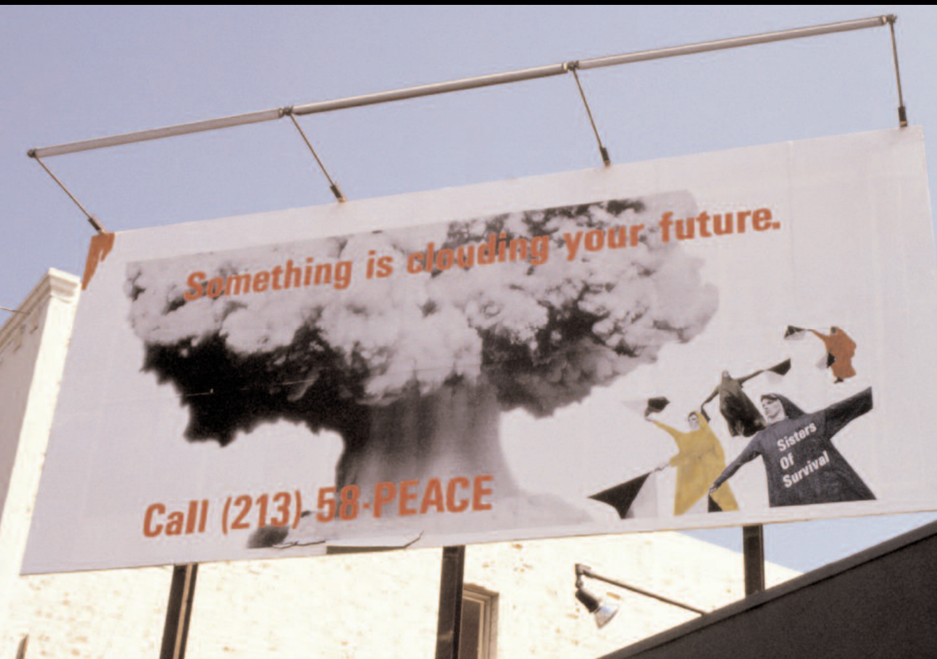
Sisters Of Survival, Something Is Clouding Your Future , 1985. Billboard in West Hollywood, for “Secular Attitudes” exhibition at Los Angeles Institute of Contemporary Art (LAICA).