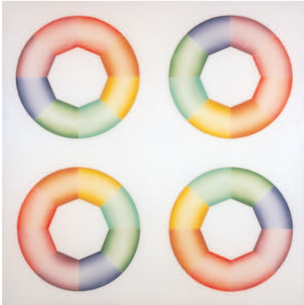
Judy Chicago, Pasadena Lifesavers: Red Series #3 , 1969–1970. Sprayed acrylic lacquer on acrylic, 60" x 60". Photograph by Donald Woodman. © Judy Chicago.

commercially successful artists were men, and the cool, industrial look of Finish Fetish art dominated the Los Angeles gallery scene. 7 After graduating from art school at the University of California in Los Angeles (UCLA), Chicago achieved national recognition exhibiting minimalist, geometrical sculpture made with industrial materials. In retrospect, however, Chicago felt that her modest success had been won only at the cost of abandoning her real artistic interests and suppressing her sense of gender identity. She subsequently analyzed her defensive response to the male-dominated art world: