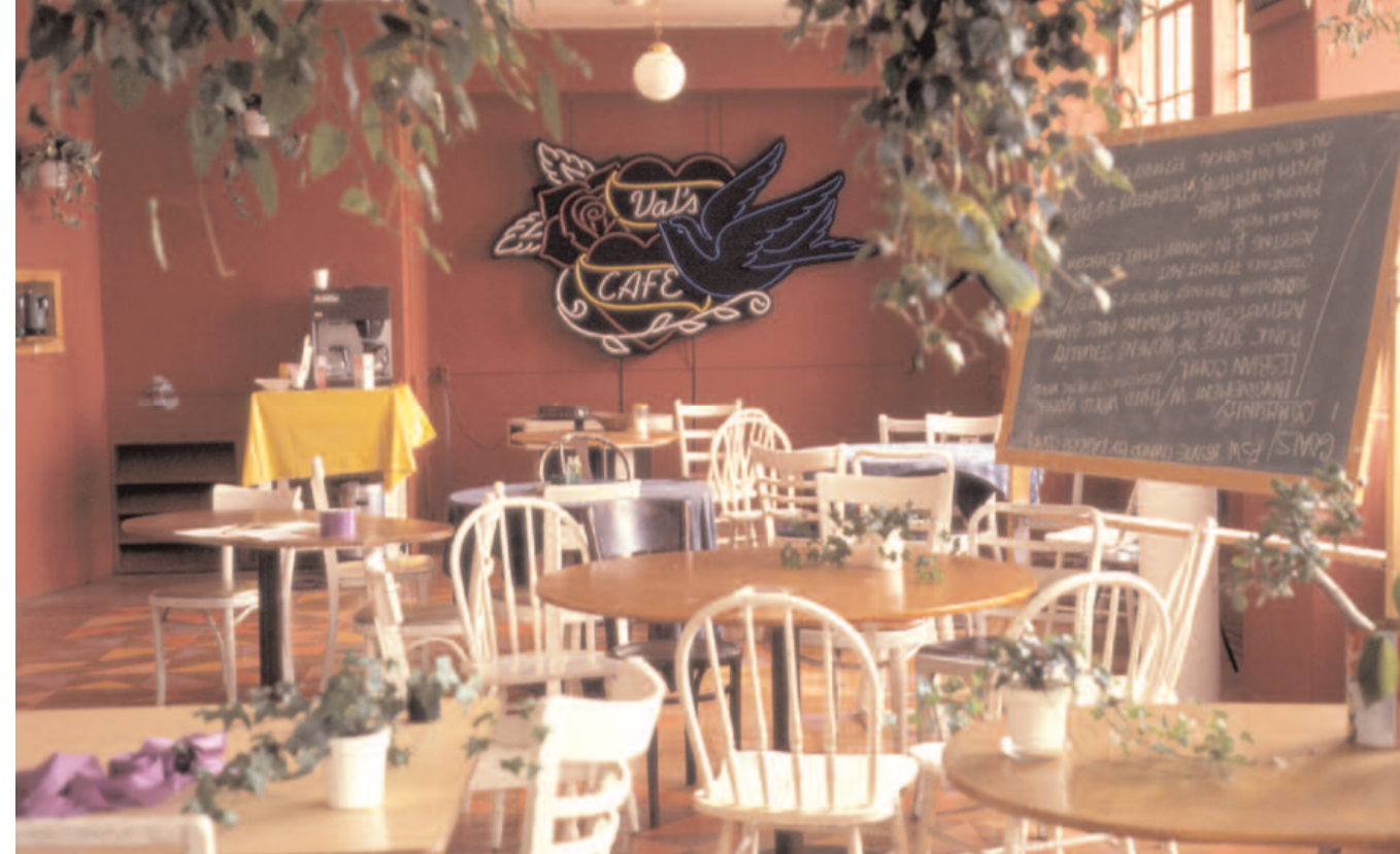
Val's Café, 3rd floor of the Woman's Building at Spring Street location, neon sign by Lili Lakich, 1977.

The split between those who envisioned the Woman's Building as a beacon for the public and those who saw it as a safe haven came to a head in 1975, when Chouinard decided to sell the Grandview Building, and the Woman's Building was forced to relocate. De Bretteville hoped to find another downtown location that would be spacious enough to accommodate a broad range of activities. Other women lobbied for a smaller space in a more remote location near the beach or in the country. Chicago located a second story space in Pasadena, a small city at the northeast edge of Los Angeles, that